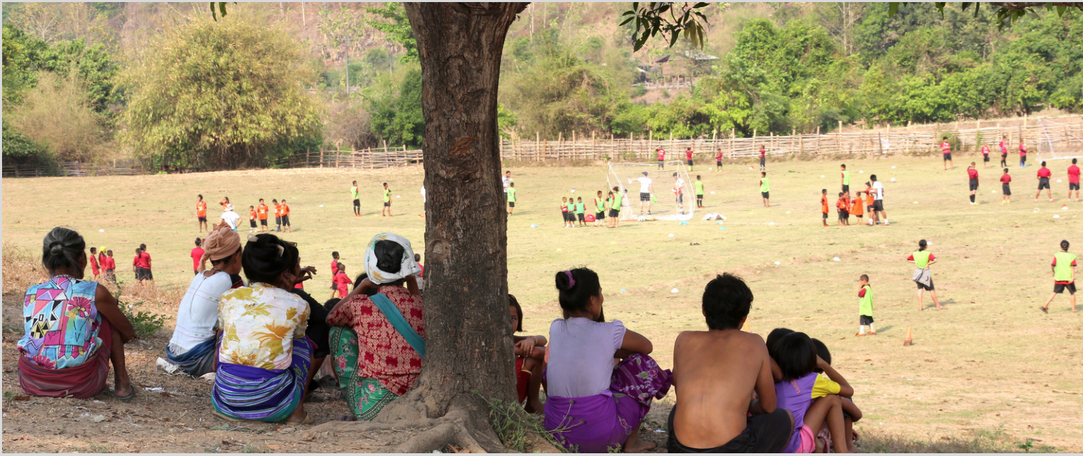
Top left: After a long day at the field playing football, nothing tastes better then a refreshing bath in the Moei river, that separates Thailand from Burma. Top right: Two boys are eagerly anticipating the medal ceremony in Noh Bo. Bottom: The Esperança Summer Camp attracted a lot of attention in Noh Bo. The field is normally a meadow for grazing cows, but this weekend the cows reluctantly had to step aside to give space for football tournament.