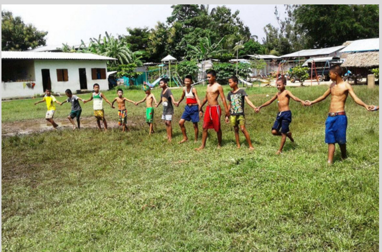
New Wave school - Warm up activities.

Sky Blue Migrant Learning Center is located next to the garbage dump in the outskirts of Mae Sot. Most of the local community lives on and of the dump-site, making it one of the most marginalized communities in Mae Sot. Inclusion of these children through sport is a key objective of PlayOnside.